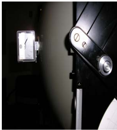
Light meter attached to perimeter