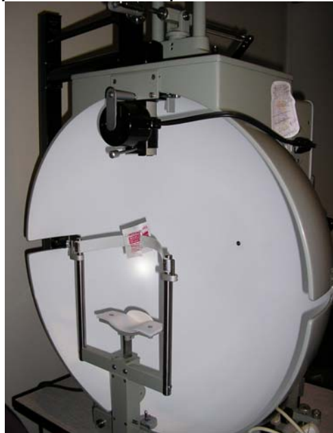
Patient side of perimeter

The perimeter is a pretty sturdy piece of equipment and with proper care should last many years. Bulbs may need replacing and the bowl should be dusted occasionally, taking care not to scratch the bowl. There is a special cleaner available from the manufacturer but this should only be used perhaps yearly or even less often if the perimeter is kept covered and clean.