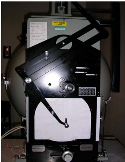
Technician side of perimeter: Note all filter handles to far right (V4e), paper in proper position.